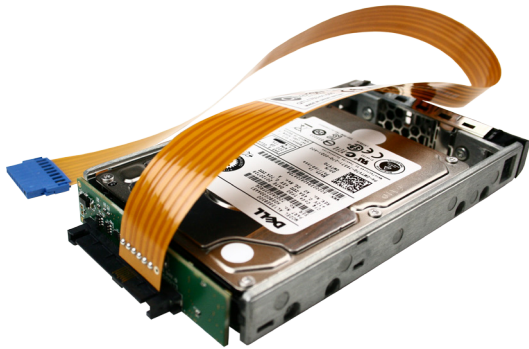
Drive Module - Attached to a drive carrier